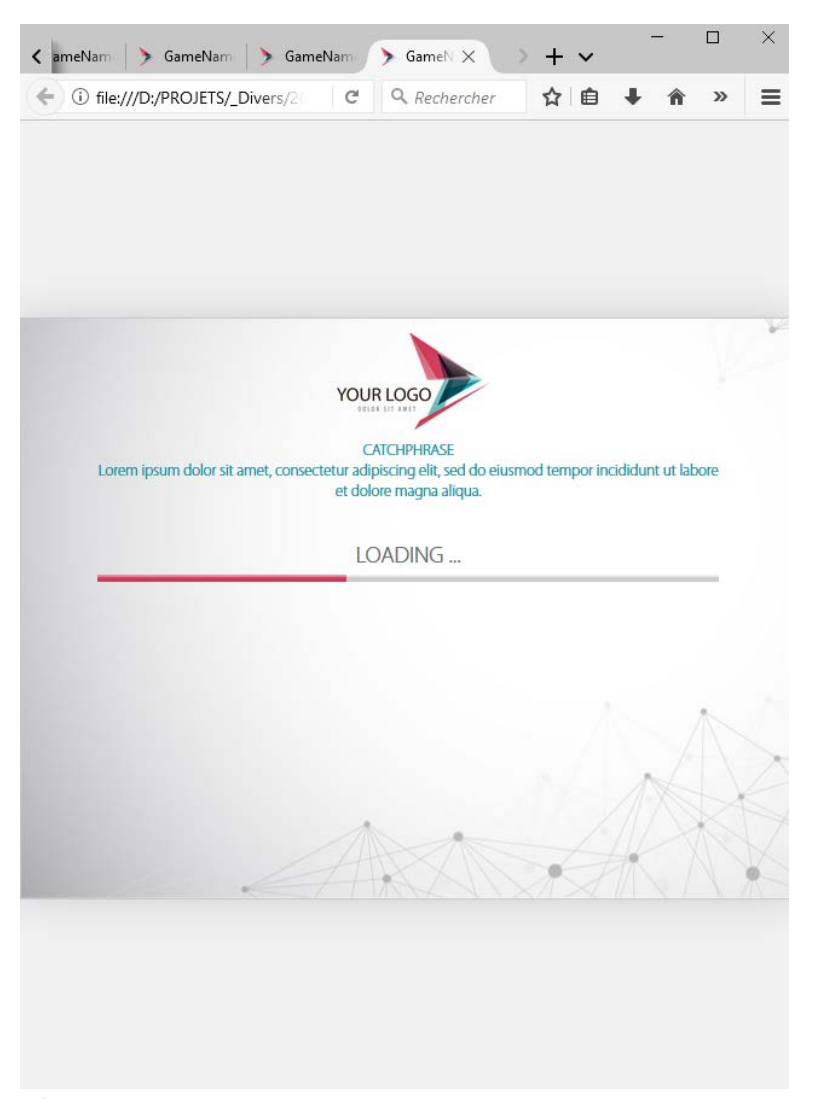
4/3 aspect-ratio is maintained for window browser resolution under 4:3.

All the font sizes and element sizes are relatives to the viewport width to fit the space in the browser window.